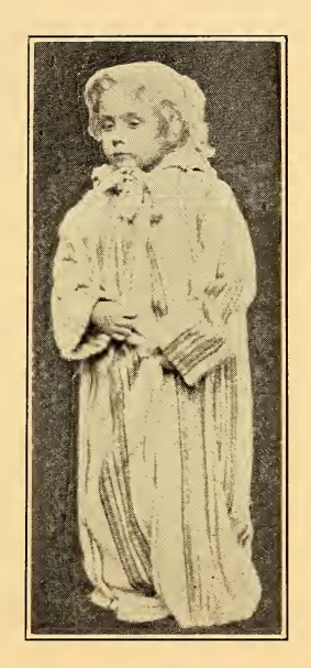
BROWNY READY FOR BED.